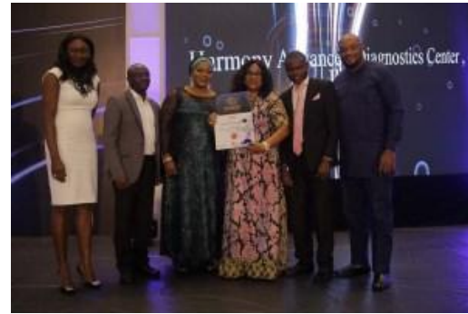
Harmony Diagnostics - Radiology Service Provider of the year 2018