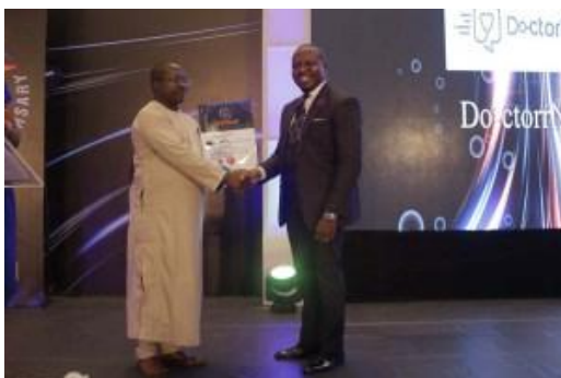
DoctorNow - PharmAccess Innovative Healthcare Service Provider of the Year Award