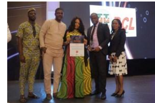
DCL laboratories - Laboratory Equipment Marketing Company of the Year 2018

Event Website: http://nigeriahealthcareawards.com.ng