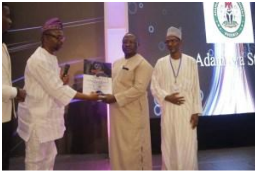
Adamawa State - Outstanding State Government of Healthcare Programme of the Year 2018

become a high profile event in the healthcare industry, gaining wide acceptance from stakeholders in the healthcare community, public and private sectors.